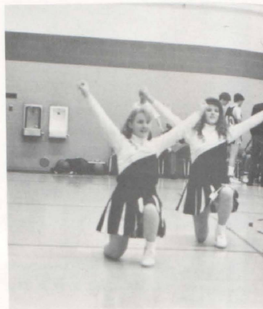
“YEAH!” The varsity basketball squad gives a big finish to their floor cheer during halftime. They spend a lot of practice time making up words and moves to their cheers.